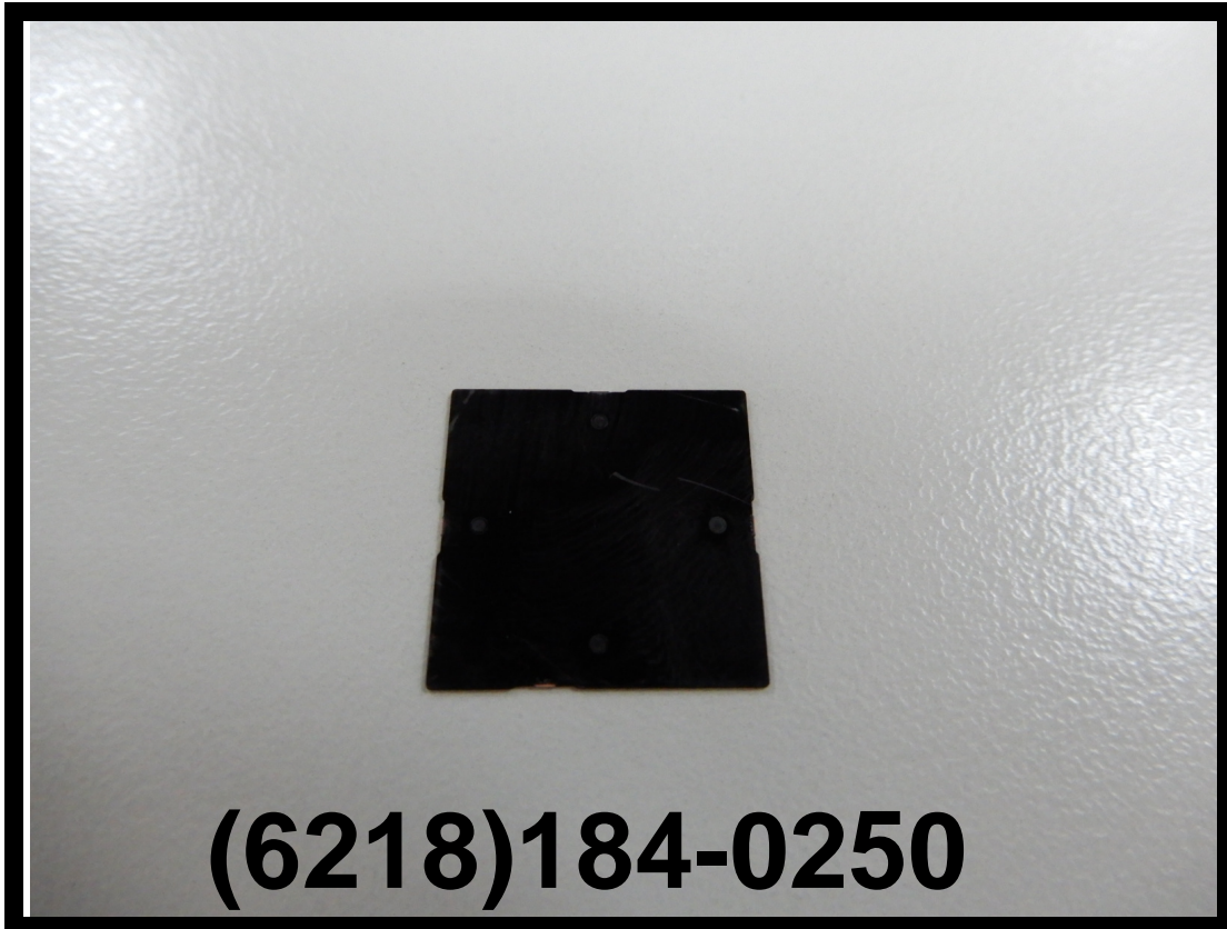
Photo of the Submitted Sample 委送樣品照片

Lab No. : (6218)184-0250 Date : July 09, 2018 Page : 7 of 9