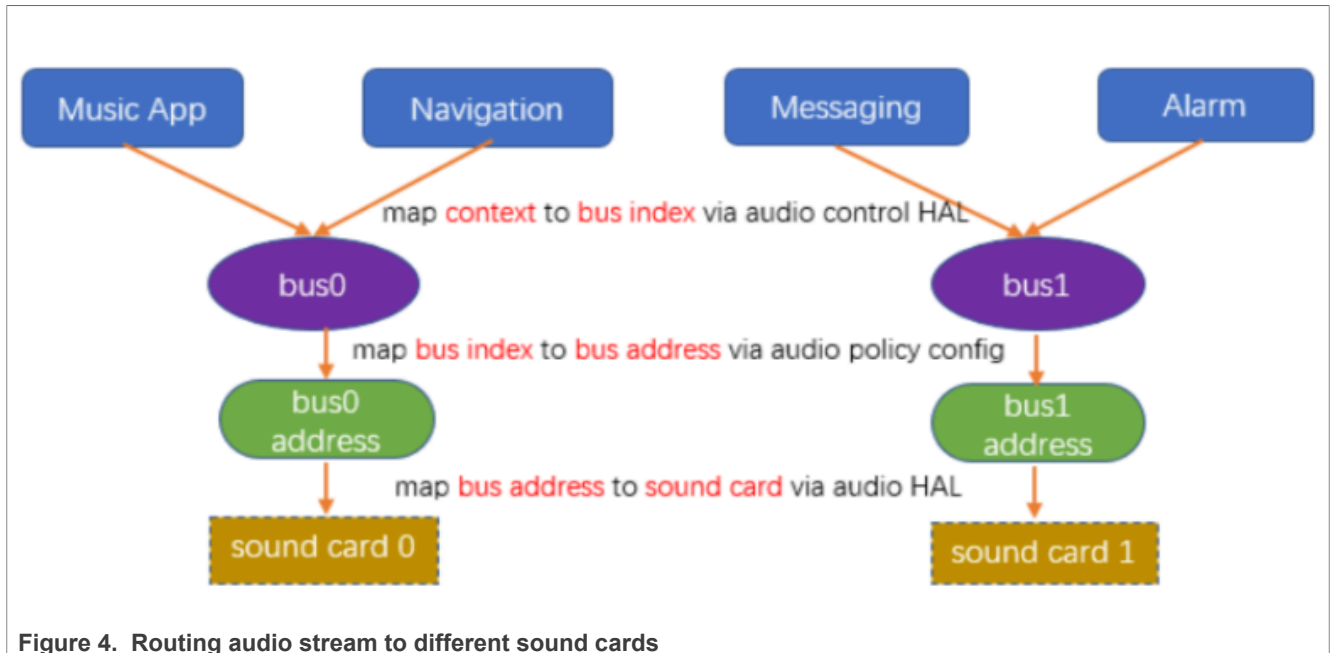
Figure 4. Routing audio stream to different sound cards