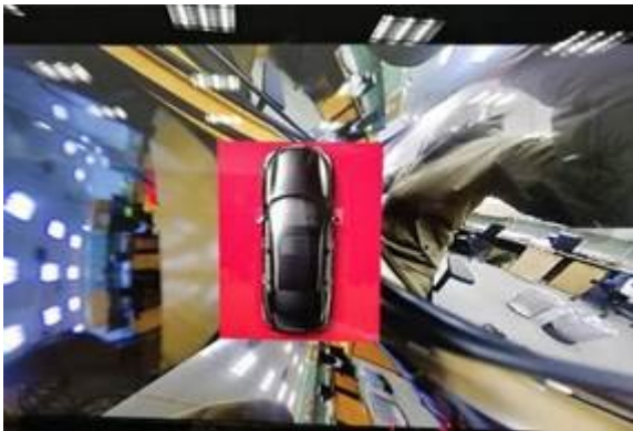
Figure 2. All cameras' views on the display