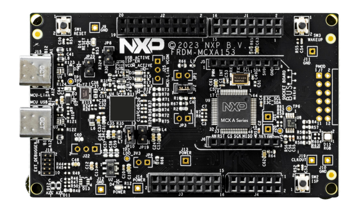
FRDM-MCXA153 FRDM Board

Developers have easy access to additional tools like our <u>Expansion Board Hub</u> for add-on boards and the <u>Application Code Hub</u> for software examples through the MCUXpresso Developer Experience.